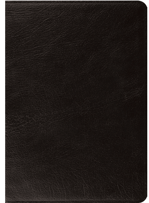
Genuine Leather, Black 978-1-4335-5339-4 $89.99